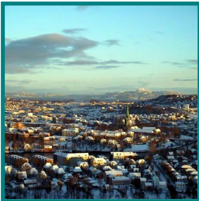
Trondheim in the Winter

"to promote and foster friendship and understanding between the people of Dunfermline and the people of Trondheim."