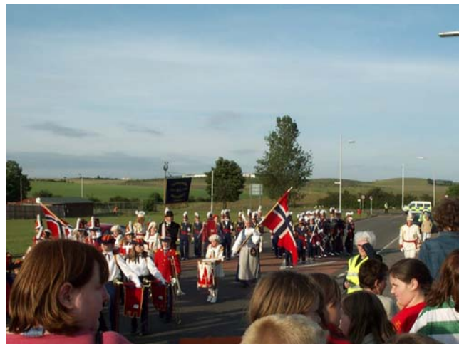
Trondheim's Bispehaugen Skolecorps Band march on Trondheim Parkway