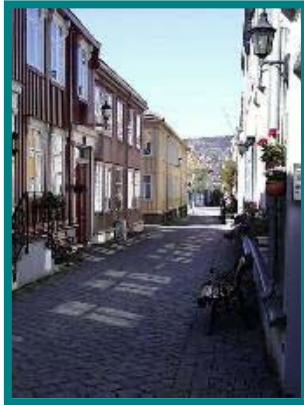
Old Trondheim Street